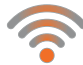
Optional Wifi connectivity