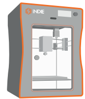
Ergonomically/ Aesthetically Designed