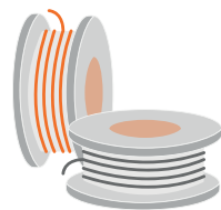
3rd Party Filaments